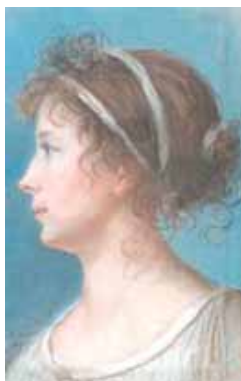
Vigée Le Brun – AUTOPORTRAIT