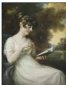
Russell – Young woman reading a book in a landscape