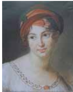
Vigée Le Brun – Mlle de PRONT