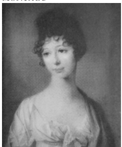
Tischbein J F A – MARIA Pavlovna Erbprinzessin von Sachsen-Weimar