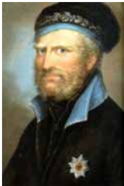
FRIEDRICH Wilhelm Herzog von Braunschweig-Lüneburg-Oels