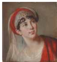
Vigée Le Brun – Giuseppina GRASSINI