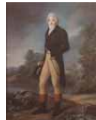
Favart – Le citoyen N... en pied