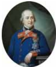
Geiger – MAXIMILIAN I. Joseph Herzog von Pfalz-Zweibrücken, Kurprinz Max IV. Joseph