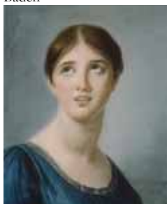
Vigée Le Brun – Tête de jeune femme