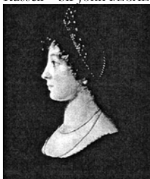
Le Brun J – Tsaritsa ELISAVETA Alexeievna, née Luise Prinzessin von BADEN