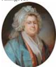
Forsslund – Woman