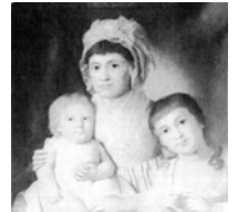
Caffé – Woman with children