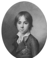
Juel – Arveprins FERDINAND FREDERIK