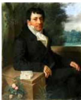
Caffé – Member of the RICHTER-Wappler family in a black coat