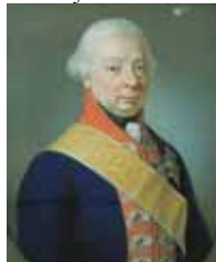
Becker – KARL FRIEDRICH Markgraf von Baden-Durlach