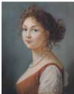
Vigée Le Brun – LUISE Augusta Amelia Königin von Preußen