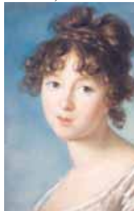
Vigée Le Brun – La princesse CZARTORYSKA, née Aniela-Angélique Radziwillowa