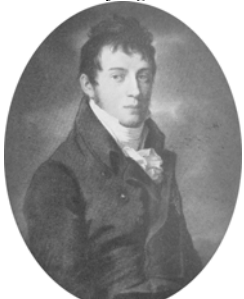
Tischbein J F A – KARL FRIEDRICH Erbprinz von Sachsen-Weimar