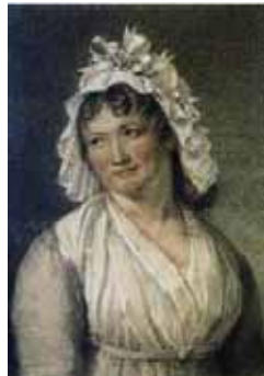
Saint – Jeune servante