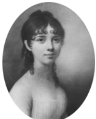
Juel – Prinsesse JULIANE SOPHIE, senere Herzogin von Hessen-Philipstal