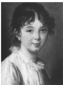
Vigée Le Brun – Jeune fille