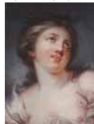
Hoin – Mme Jean-Henri Gourgaud, dite Mme DUGAZON, née Louise-Marie Lefèvre