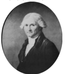
Capet – Homme