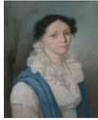
Bardou C W – Femme en robe blanche, châle bleu