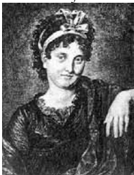
Büri – Frau GOETHE, née Christiane Vulpius