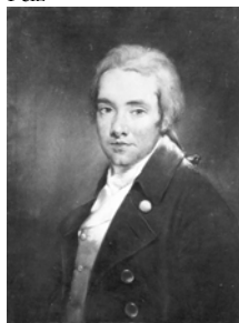
William WILBERFORCE