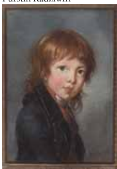
Vigée Le Brun – Garçon