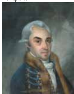
Wagner A – Peter Carl von BRUKENTHAL