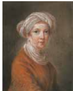
Vigée Le Brun – AUTOPORTRAIT en robe orange, au turban