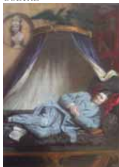
John Horne TOOKE