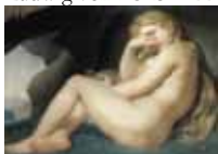
Caffé – Frauenakt in Einer Grotte