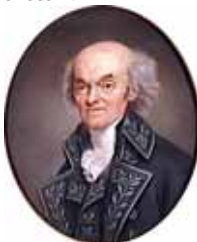
Ducreux – Joseph-Jérôme Lefrançois de LALANDE