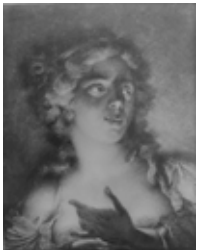
Hoin – Jeune femme: effet de lumière