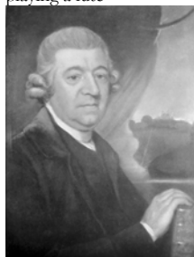
Rev. Nevil MASKELYNE