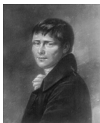
Friedel – Heinrich von KLEIST