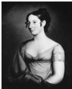
STÉPHANIE-Louise-Adrienne Großherzogin von Baden