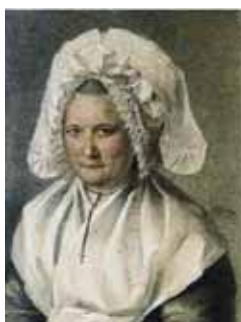
Sainr – Une servante