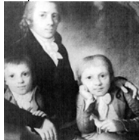
Caffé – Man with children