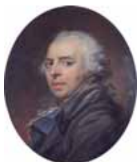
Hoin – AUTO PORTRAIT