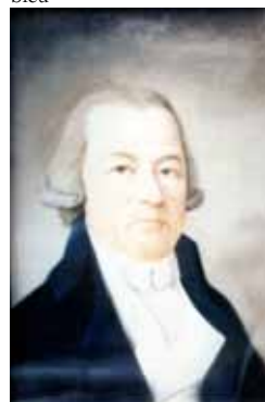
Wagner A – Inconnu