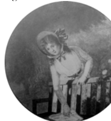
Debucoart – Jeune femme