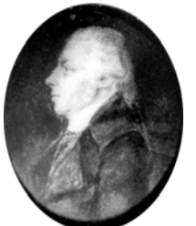
Anspach – Rhijnvis FEITH