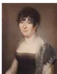
Gagnereaux B – Femme portant une mantille