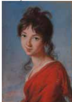
Vigée Le Brun – La princesse LUBOMIRSKA, née Teresa Czartoryska