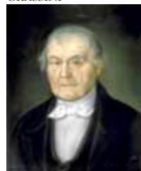
Baillaigé – Homme