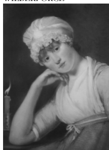
Russell – Young lady in a bonnet with a candle