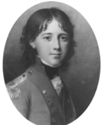
Juel – Prins CHRISTIAN FREDERIK, senere Kong Frederik VIII