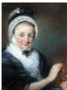
Russell – Lady holding a book