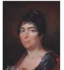
Hoin – Femme