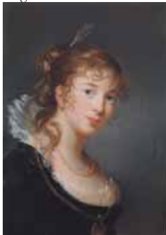
Vigée Le Brun – Friederike LUISE Dorothee Philippine Fürstin Radziwill