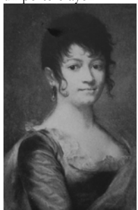
Giordano – AUTORITRATTO