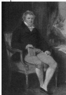
Smith – William Charles, 4 th Earl of ALBEMARLE