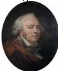
Hoin – AUTO PORTRAIT