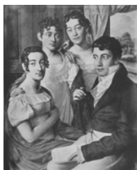
Caffé – Die Geschwister BAERBALCK