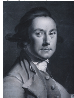
J.806.105 SELF-PORTRAIT, in a black feathered hat, monochrome pstl/ppr, 53.3x36.8 (Derby Museum & Art Gallery, inv. 1953-186. John Leigh Philips 1809. W. Bemrose 1883). Exh.: Derby 1883, no. 43; Norwich 1959; Wright 2001, no. 53, fig. 44; Wright 2007, no. 53; Wright 2025a. Lit.: Nicolson 1968, no. 168, fig. 70, as c.1767–70; Barker & al. 2009, fig. 9, n.42, as c.1778; Jonny Yarker, review of Wright 2025a, Burlington magazine , .XI.2025, fig. 5, as chalk φ