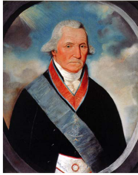
J.798.129 Gentleman, pstl, 61x48.3, s (Cambridge, Massachusetts, CRN, 17.XI.2002, Lot 11, $400)