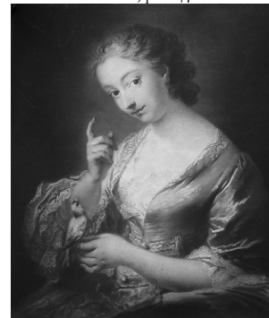
~cop., pnt. (Monaco, Sotheby's, 26.X.1981, Lot 550 repr., as Nattier, of Mlle de Saint-Prie)

1.746.122 ~cop., pstl (Montauban, 14.XI.2004, Lot 318 repr., Italian sch. XVIII e , inconnue, est. €3700–4000) øπ