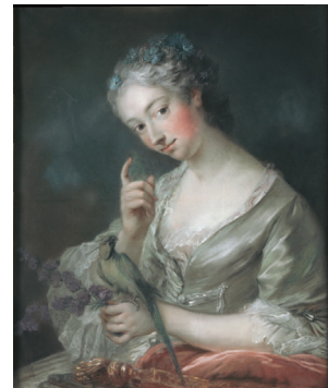
1.746.119 ~version, pstl øß