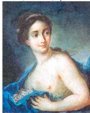
J.65.108 =?Belle femme tenant des fleurs, copie très soignée, a/r Rosa Alba (Saint-Non; Paris, Lemonnier, Paillet, 2.V.1792 & seq., Lot 44 part)