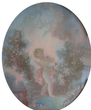
J.65.106 Jeune fille avec des fleurs, a/r Carriera, 54x49.5, sd 1777 (Galerie de Félix-Huet, Village Suisse, 4–8.IV.2002). Lit.: Gazette Drouot , 29.III.2002, repr. Φ