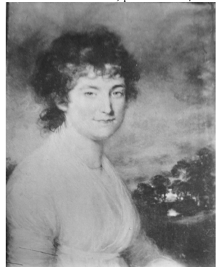
~?pastiche a/r, v. J.64.1612