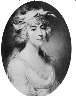
J.64.1383 ~cop., pstl, 53x43 ov. (Tours, Odent, 23.VI.2008, Lot 15 repr., Éc. fr. XIX<sup>e</sup>, est. €300–400) [?XX<sup>e</sup>] φκν

J.64.1381 ~version, ov. (n/k). Lit.: Tourneux 1908c, p. 27 repr., as \neq Veil-Picard pstl \varphi\beta