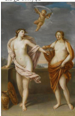
Erigone, pnt. Lit.: D. S. Pepper, “‘Erigone’: a work restored...”, Burlington magazine , CXXVIII/996, III.1986, fig. 30