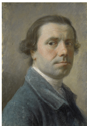
~self-portrait at an easel, pnt., c.1756 (PC). Lit.: Smart 1999, no. 430, fig. 478

J.6092.101 SELF-PORTRAIT, pstl, watercolour, 40.6x28.2, c.1755 (Edinburgh, SNPG, inv. PG727. Don David Laing, LL.D.: Royal Scottish Academy; don 1910). Exh.: Ramsay 1992, no. 52 repr. clr; Skirving 1999, no. 2 n.r.; Edinburgh 2007; Edinburgh 2008, no. 40 repr.; Ramsay 2013. Lit.: C. J. Holmes, "Allen Ramsay, drawn by himself", Burlington magazine , XXIX/157, .IV.1916, p. 26 n.r.; Smailes 1990 repr.; Smart 1999, fig. 663; Baker 2011, p. 20 repr.; Stephen Lloyd, review, Apollo , .XI.2013, p. 114 repr. φσ