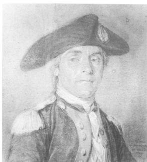
JOHN PAUL JONES. Tels hommes rarement le peuvent presenter, Et quand le ciel les donne, il faut en profiter.

J.544.101 John Paul JONES (1747–1792), naval officer, pstl, white chlk/ppr, 26x20.6, sd v "JM Moreau Le Jeune 1780 an mois de May", Salon de 1781, no. 303 (New Orleans, Louisiana State Museum, inv. 9657A). Exh.: Detroit 1851, no. 283; Toronto 1972. Lit.: Ingamells 2004, p. 297 repr. φ