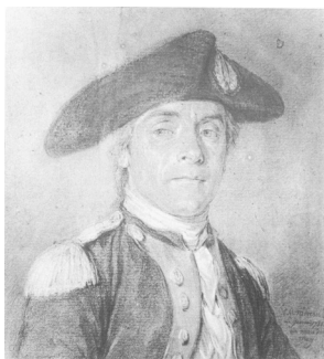
JOHN PAUL JONES. Tels hommes rarement le peuvent presenter, Et quand le ciel les donne, il faut en profiter.