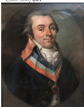
J.484.101 Onbekende man, pstl/ppr, 35.8x31, sd “A. Liernur/1789” (Aardewerk Antiques, Leidschendam, 2015; PC 2015) φ

J.484.051 Yves SOULIGNAC (1758–1823), député à la Convention nationale, pstl, 57.5x44.5, sd illisible “Li.../1795” (PC 2018; Paris, Drouot, Millont, 29.XI.2018, Lot 77 repr., attr., est. €300–500) φαν