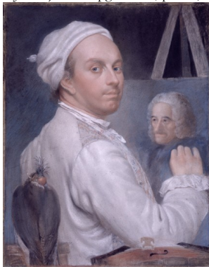
J.407.107 Charles BONNET (1720–1793), naturaliste, pstl, 62x51 (Saladin 1924). Lit.: Baud-Bovy 1924, pl. xii, attr. φσ