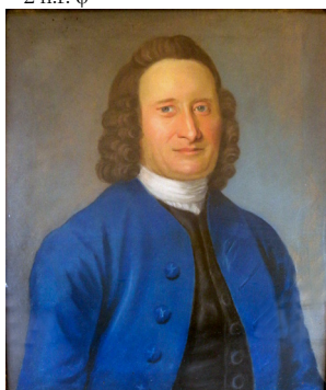
J.249.105 Samuel II ALSTON (1721–1796), attorney, pstl, 1752 (Ipswich Museum, Christchurch Mansion. Desc.; legs 2003). Lit.: Farrer 1908, p. 268, no. 3 n.r. φ