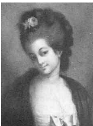
J.153.116 Jeune paysanne, pstl, 50x41.5 (Vienna, Schönbrunn, 55007 AC, ?GG-9845; Castello di Miramare). Lit.: L&R A22 repr.; R&L R92 n.r., ??Liotard [new attr.] φv