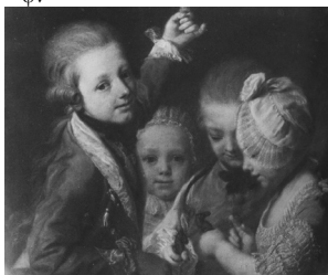
J.153.131 Vier Mädchen und Knaben, pstl, 53.5x69 (Vienna, Schönbrunn, 55015 AC, GG-9853; Castello di Miramare, Trieste). Lit.: L&R A17 repr.; R&L R92 fig. 830, ??Liotard; [new attr.] φv