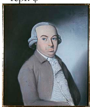
J.132.132 Man in a blue-grey coat, pstl, 26x20.6 ov. [c.1780] (London, Christie's South Kensington, 21.II.2012, Lot 292 repr., Dutch sch., est. £500–700, b/i) [new attr., ?] φαν