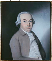
J.132.132 Man in a blue-grey coat, pstl, 26x20.6 ov. [c.1780] (London, Christie's South Kensington, 21.II.2012, Lot 292 repr., Dutch sch., est. £500–700, b/i) [new attr., ?] \phi\alpha\nu